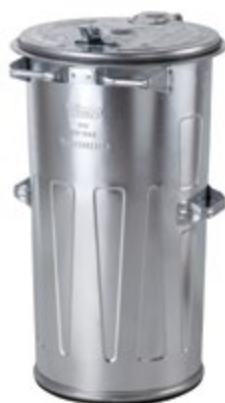
Type 1008 (0.8 mm metal sheet)