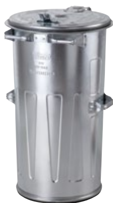
Type 1006 (1 mm metal sheet)