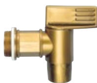
Type 1280 2" connection