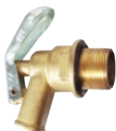
Type 7005 3/4" connection