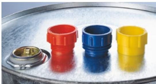
Mauser plastic Type 0073