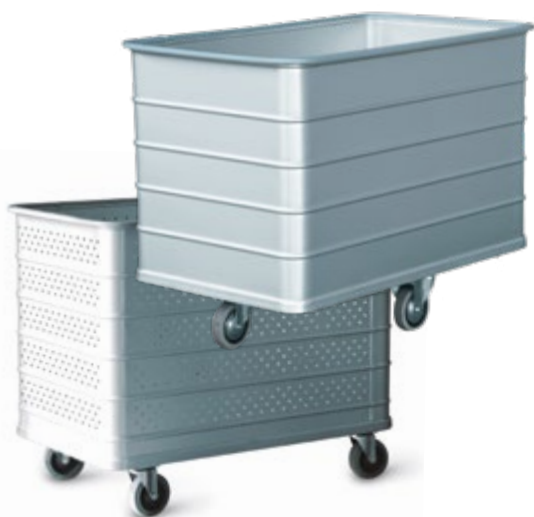
Type 7288 (solid)