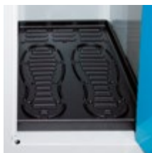
Type 3860 for 250 mm width