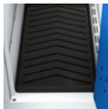
Type 3861 for 300 mm width