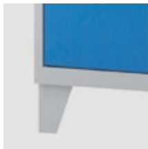
Type 4899 120 mm