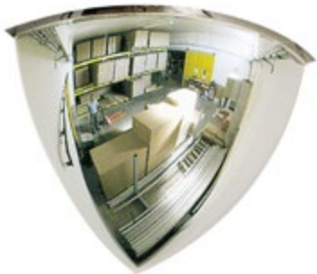
Monitoring of 2 directions.