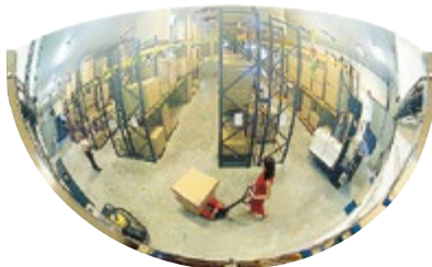
Monitoring of 3 directions.