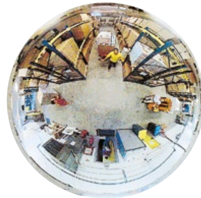
Monitoring of 4 directions.