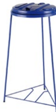
Type 1050 – painted