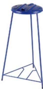
Type 1049 – painted