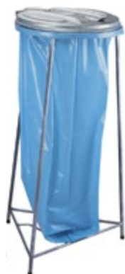
Type 1064 – galvanised