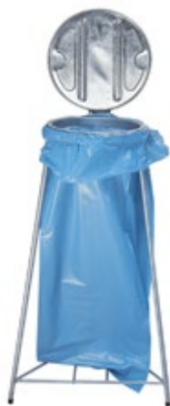
Type 1065 – galvanised